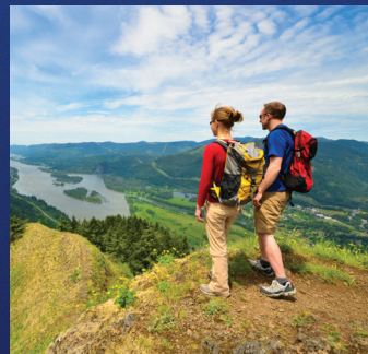
EXPERIENCE ADVENTURE TRAVEL