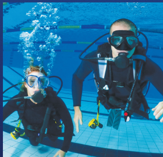
EXPERIENCE SCUBA & SNORKELING