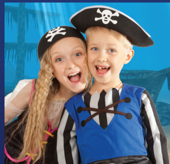
EXPERIENCE ADVENTURE FUN FOR KIDS