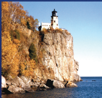
EXPERIENCE GREAT LAKES TREASURES