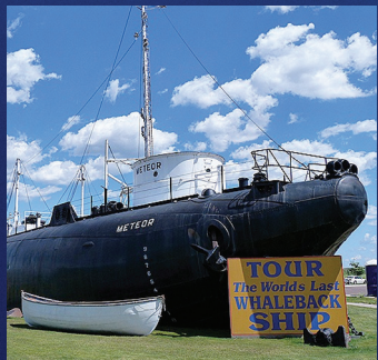
EXPERIENCE MARITIME HISTORY

FEBRUARY 23, 2013 • CROWN PLAZA HOTEL • BROOKLYN CENTER, MINNESOTA